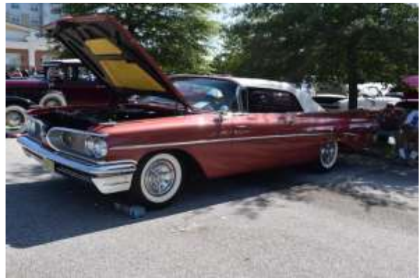
POCCI Nationals Gettysburg