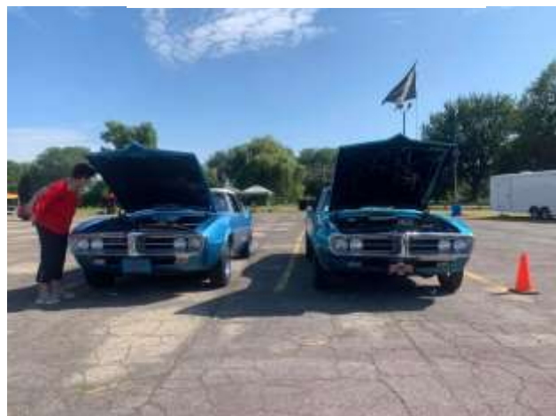
Indian Uprising St Charles