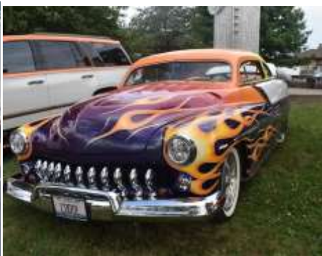
Columbus Good Guys Show