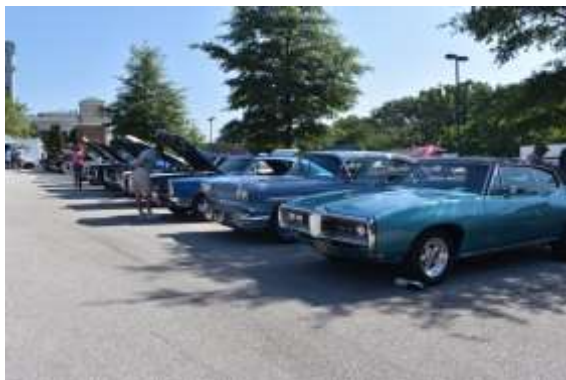
POCCI Nationals Gettysburg