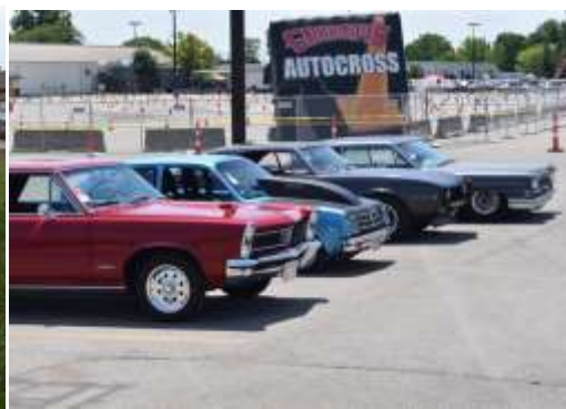
Columbus Good Guys Show