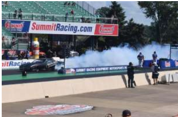
Tri-Power Nationals Norwalk