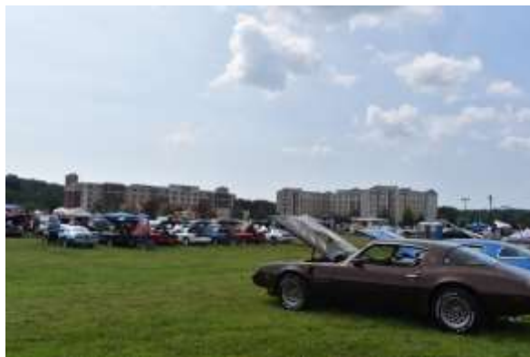
POCCI Nationals Gettysburg