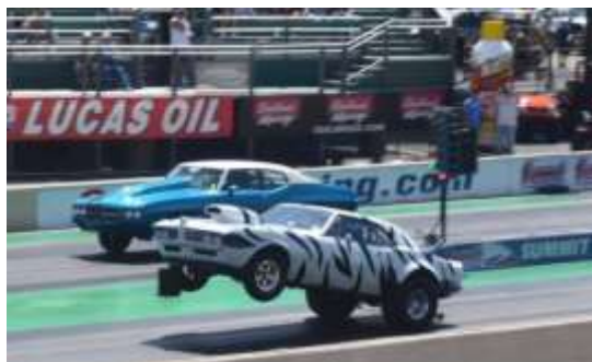
Tri-Power Nationals Norwalk