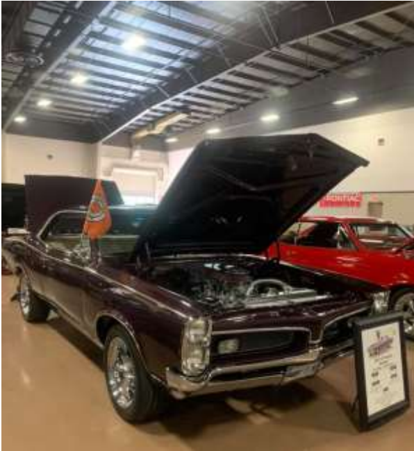
Indian Uprising St Charles