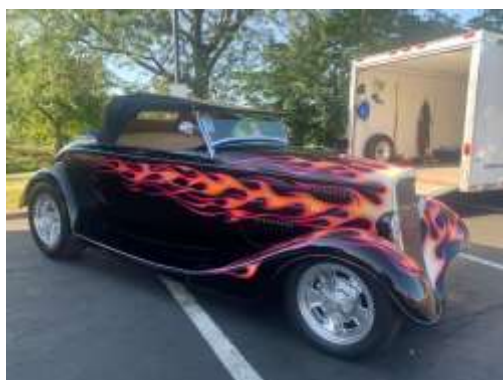
Columbus Good Guys Show