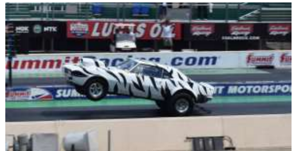
Tri-Power Nationals Norwalk