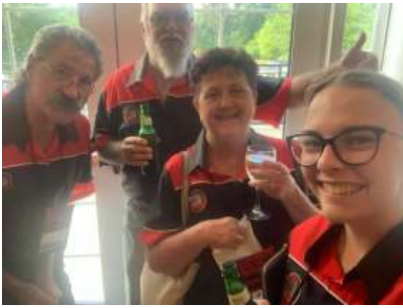
POCCI Nationals Gettysburg