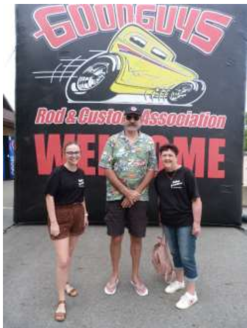
Columbus Good Guys Show