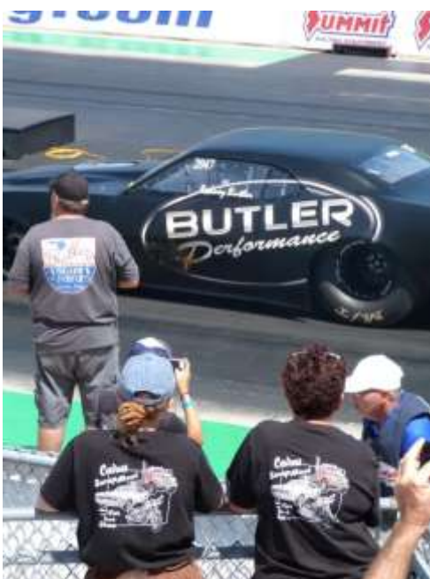
Tri-Power Nationals Norwalk