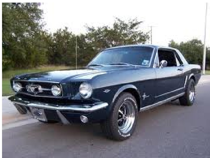
The car is similar to this 1965 Mustang